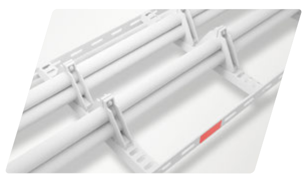
3. After complete drying and determination of the dry film thickness, remove adhesive tape and/or covers.