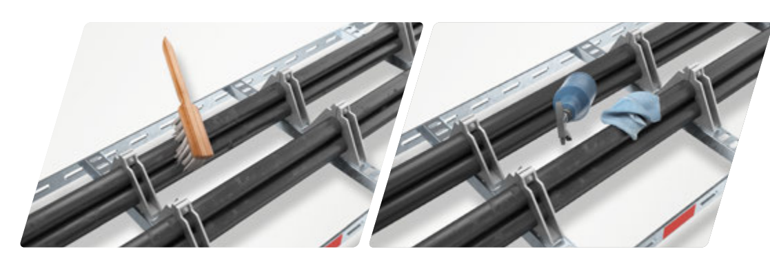
1. Clean dust and dirt from cables/cable support structures.